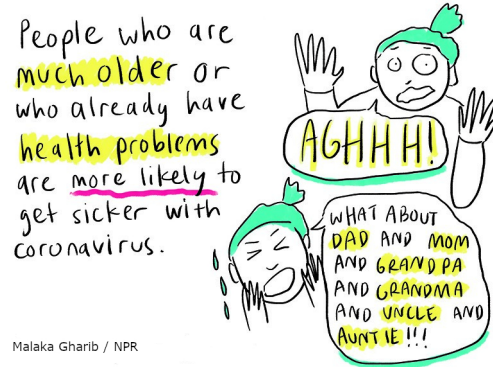
Figure 2: Underlying topoi: Old people are more likely to get more ill with coronavirus

Although a more general version that older people (and those with underlying medical conditions) are more likely to become more ill, or die if they contract other potentially fatal infectious diseases probably did exist for most adults prior to the coronavirus, Greta has not previously encountered such a topos. Nevertheless, based on her corona-specific new topoi, she is able to apply a more general (in this case incorrect) version of this topos (15).